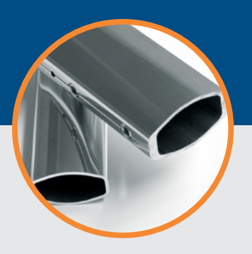
Arms & Bows