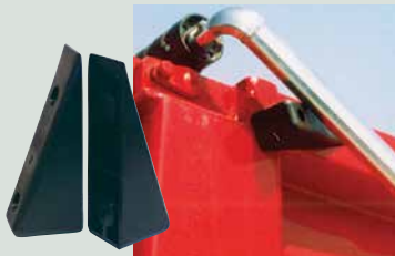
• Bow Centering Wedges

Convenient trailering accessories for one-stop purchases.