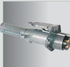
• Dual Conductor Plug Set