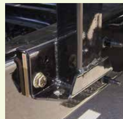
• Side Frame (DC204 Only)