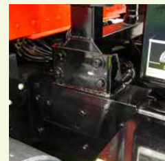
• Angle Iron